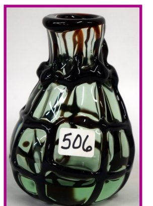
506 Dominick Labino 1970 clear green vase, brown net like lattice encasing 5.75" tall