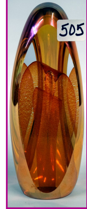
505 Ed Kachurik 2004 sculpture, amber exterior, faceted, two iridescent gold veils, controlled bubble 7.25 "