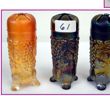
Online bidding applies, see whalenauction.hibid.com for online terms & registration.