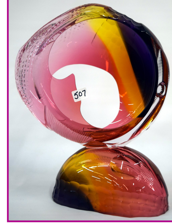
507 Leon Applebaum "Transformation" 2-piece sculpture in violet, amber & red, textured surface, highly polished, 14"