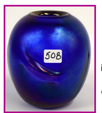
508 Dominick Labino 1975 cobalt blue vase, slightly iridized, tooled design in ovoid shape 6"