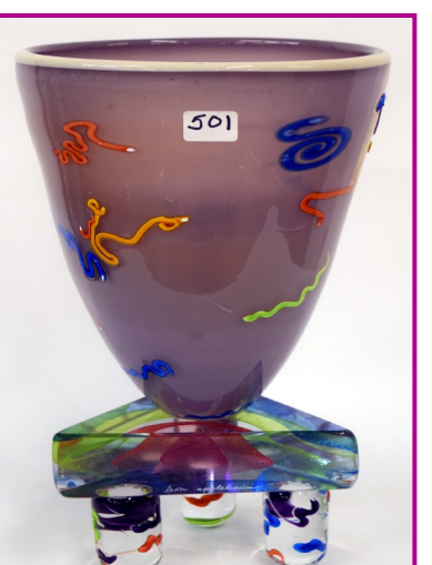
sical vase, modernistic fun design, lavender color, many