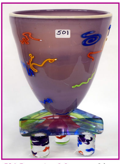
501 Leon Applebaum, whimsquiggles, base is clear triangle shape with 3 legs, 15.5"