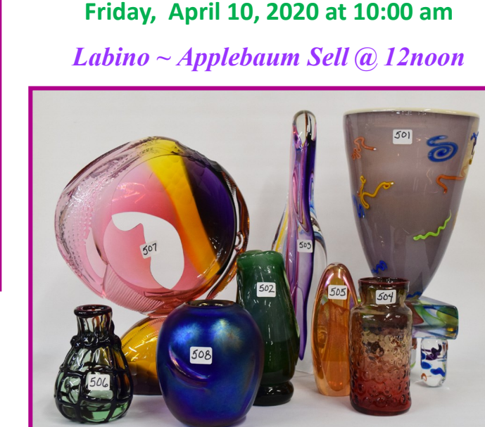
green vase, unusual color, milky swirl, 2 elongated prunts with fold over glass, footed, 8"