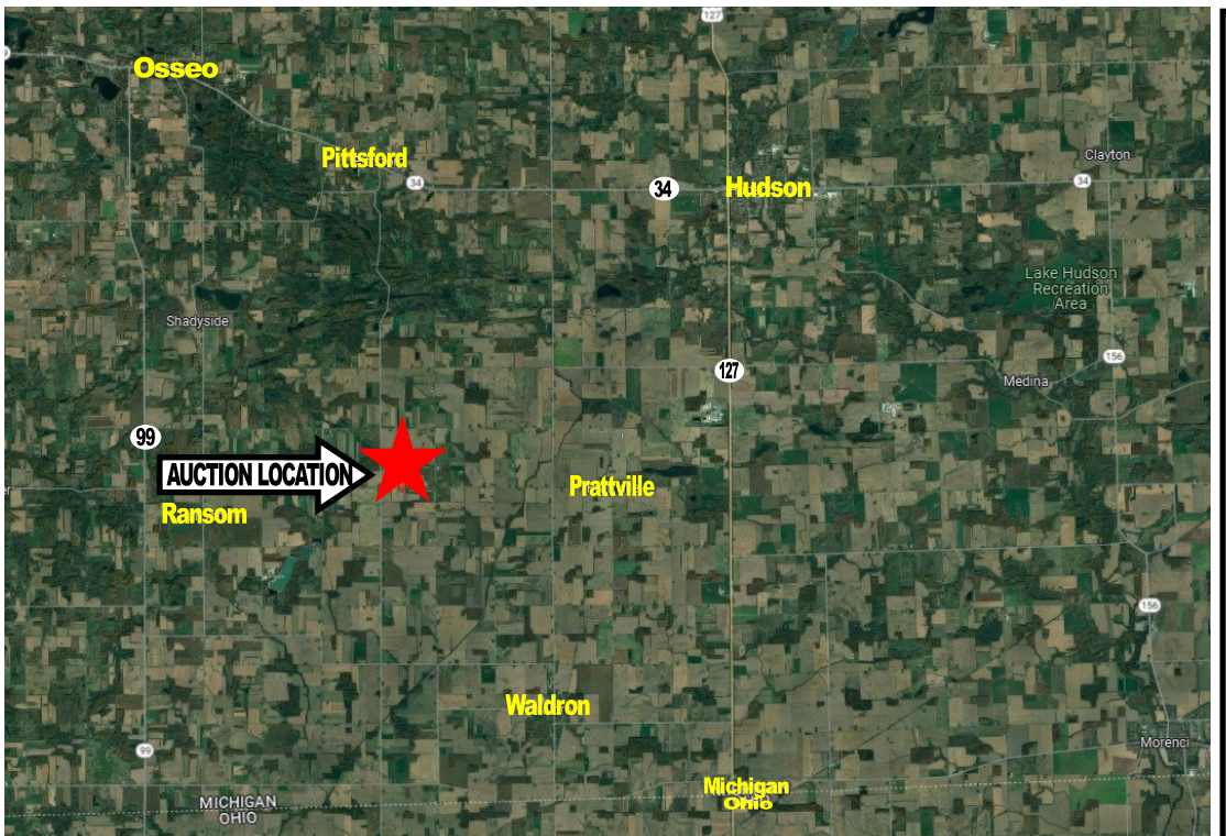
Open For Inspection: Monday January 22nd from 10:00am - 3pm

Terms: $20,000.00 down on each tract in certified funds w/balance at closing. Closing will be held on or before 45 days.. Have finances ready, selling absolute to the highest bidder "as is where is." No Buyer's Premium. All information was derived from sources believed to be correct but not guaranteed. Dimensions are approximate. Buyers need to rely entirely on their own judgement and inspections of property records. Announcements made the day of the auction take precedence over printed materials. See whalenauction.com for more information.