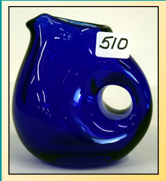
510 Dominick Labino 1975 cobalt pitcher hot tooled handle 5"

509 Leon Applebaum 3 pc sculpture 18" variety of colors, controlled bubble design