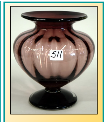
511 Purple paneled footed vase 7.5"