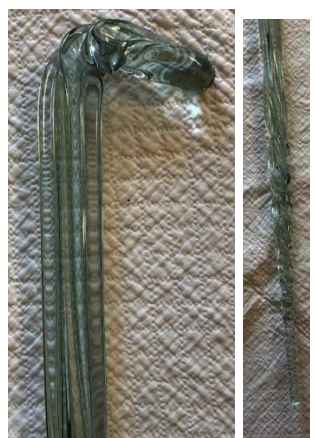
Cane #19 33 inch rod, 29 ½ inch working length Solid handcrafted beveled square green glass cane with jcurve twisted grip and twist at bottom