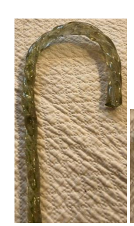
Cane #41 37 ½ inch rod, 34 inch working height Solid glass, slight yellow tint with green vine in core, twisted entire length, j-curved grip