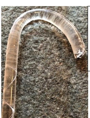
Cane #40 13 ½ inches Solid, smooth round shaft, clear glass, j-curved grip doll cane with incised, spiral ribbons

Clear glass, hand-blown parade cane, smooth round shaft, white spiral ribbons, globe top, tapered tip