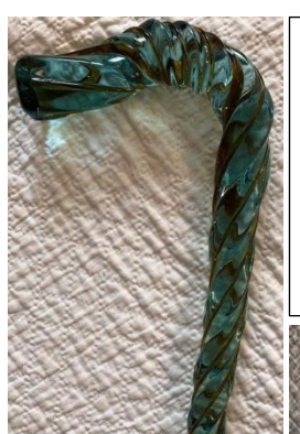
Cane #35 43 inch rod, 38 ½ inch working height Solid handcrafted turquois tinted glass cant, twisted from bentover grip to tapered tip, amber ribbon spiral