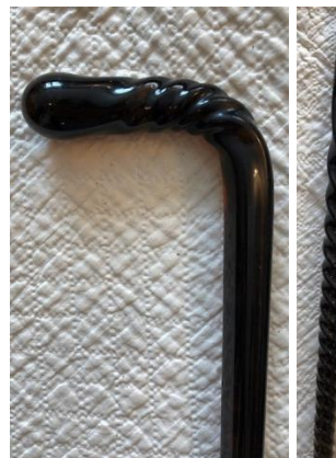
Cane #34 45 inch rod, 41 inch working height Solid glass handcrafted square cane, coffee-colored, bentover twisted grip, twist on tip, tapered.

Tinted green handcrafted solid glass cane, smooth round rod at top half, bent-over grip, twisted bottom half, slight taper. Full length only visible above, in rack.