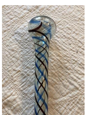
66 1/2 inches

Hand-blown clear glass globe end, round, smooth shaft parade cane, burgundy and blue spiral ribbons