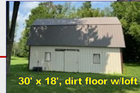
30' x 18', dirt floor w/loft