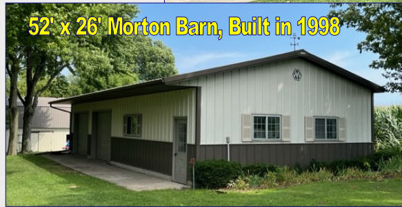
52' x 26' Morton Barn, Built in 1998

Open For Inspection: Wednesday September 27 from 5-6:30pm.