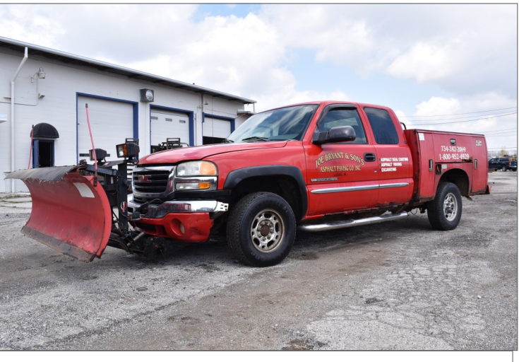
2004 GMC 2500HD SLE

1995 International 4700 Low Pro seal coat truck