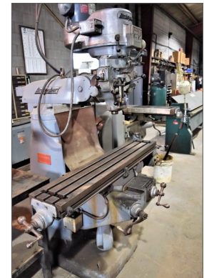
Bridgeport Series 1 vertical mill