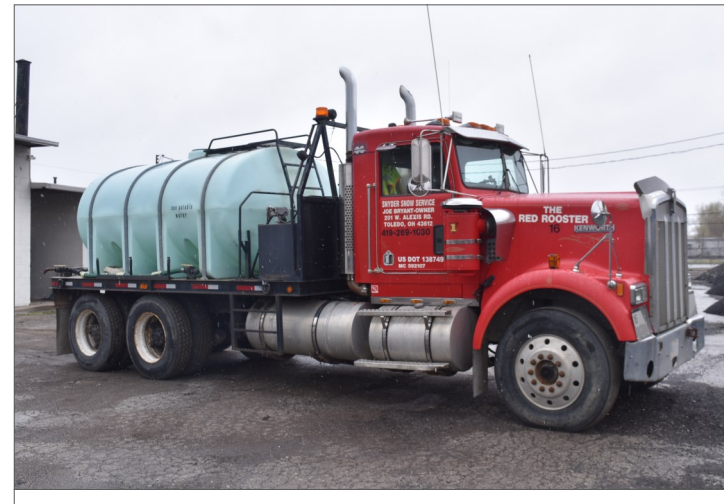
1993 Kenworth W900 Water Truck

Whalen Realty & Auction Itd, Whalen Realty & Auction Itd?