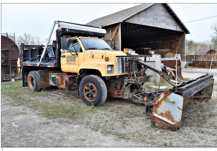
1994 Top Kick dump/plow truck