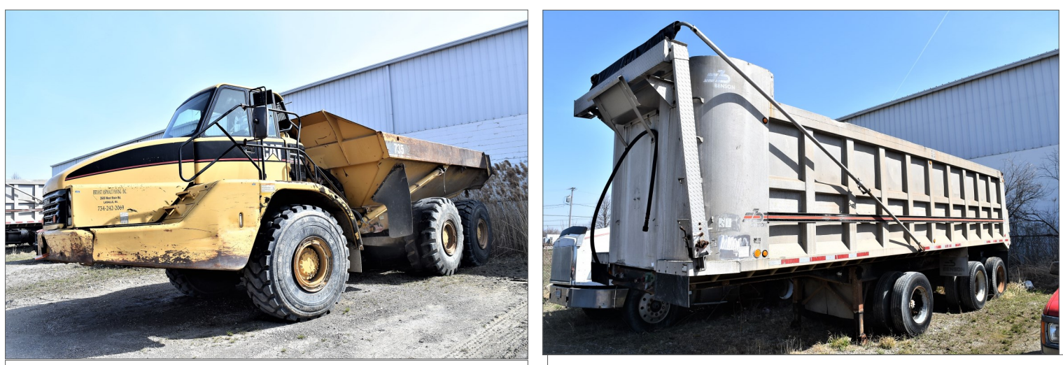
2004 CAT 735 articulated haul truck