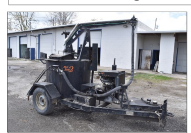
2003 Step Hot Shot 2D crack filler