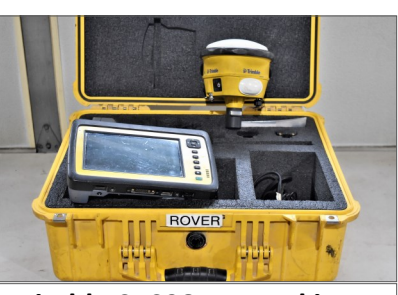
Trimble SPS985 rover kit