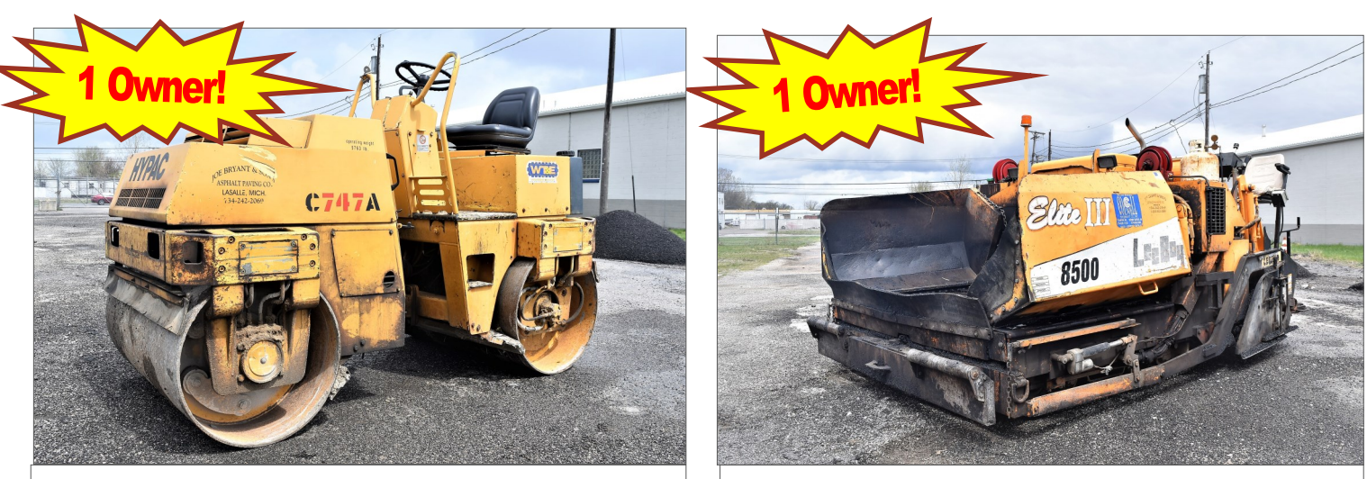
1994 Hypac C747A vibratory compactor, 1 Owner!