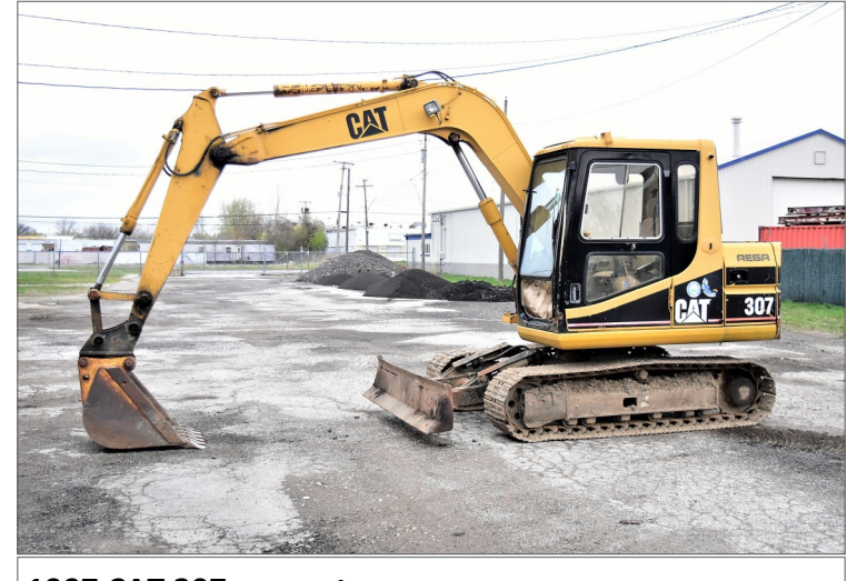
1997 CAT 307 excavator