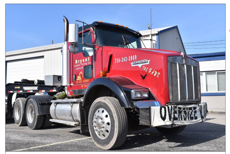
2005 Kenworth T800