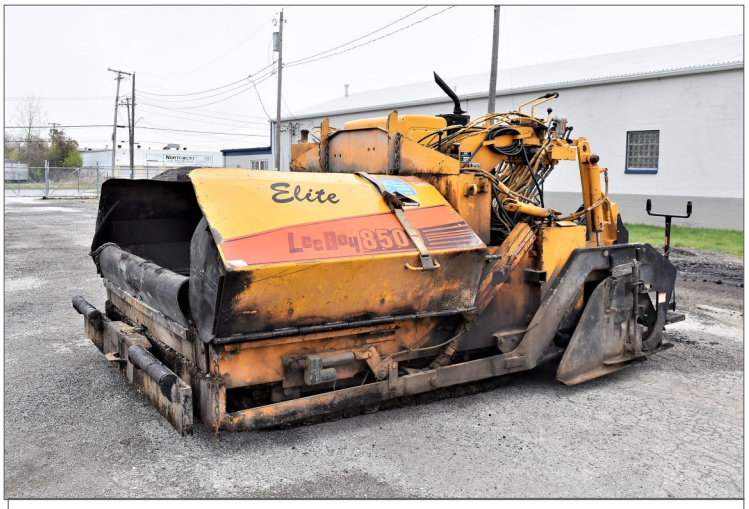
1995 Leeboy 8500 Elite paver