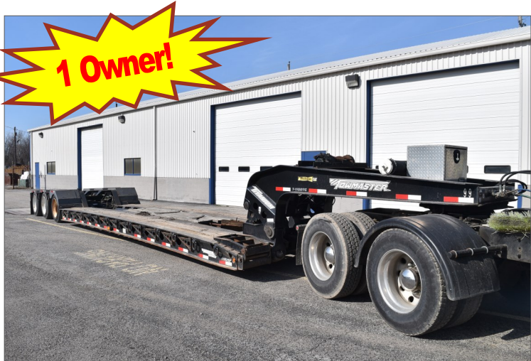
2008 Towmaster Titanium T-110DTG, 1 Owner