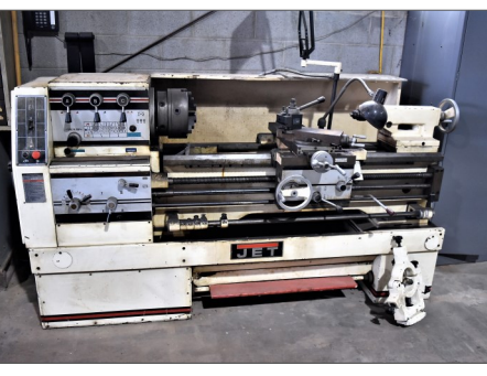
Jet 1440-3PGH engine lathe