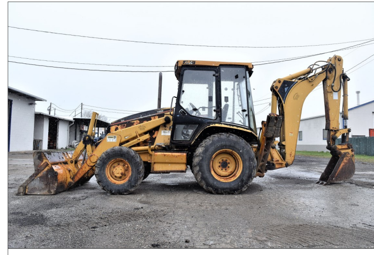
1997 CAT 416C backhoe