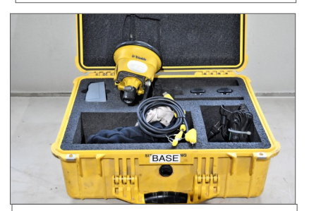
Trimble SPS985 base kit

Pick Up Dates: Sunday June 4th from 9am-12pm., Monday June 5th & Tuesday June 6th from 9am-3pm.