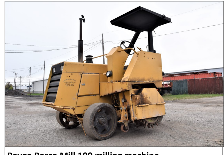
Raygo Barco Mill 100 milling machine