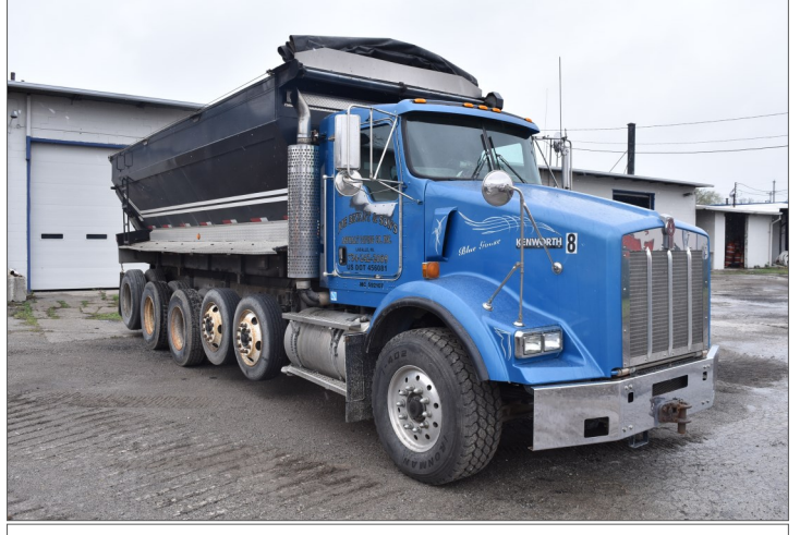
2003 Kenworth T800 6 axle live bottom dump