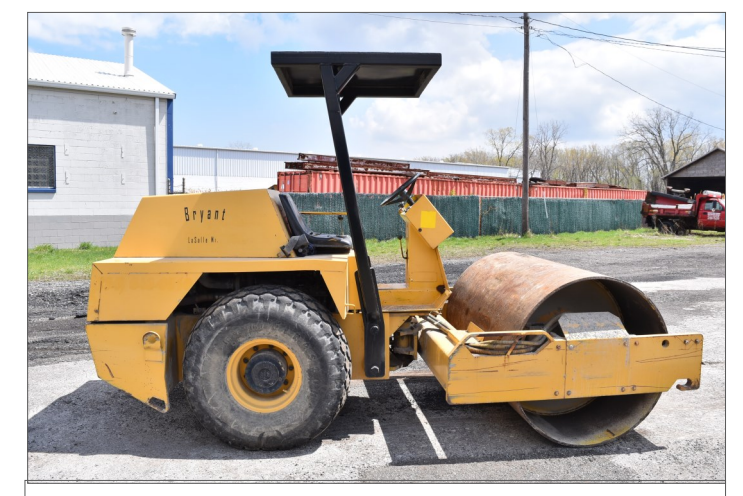
Compac T-50D vibratory compactor