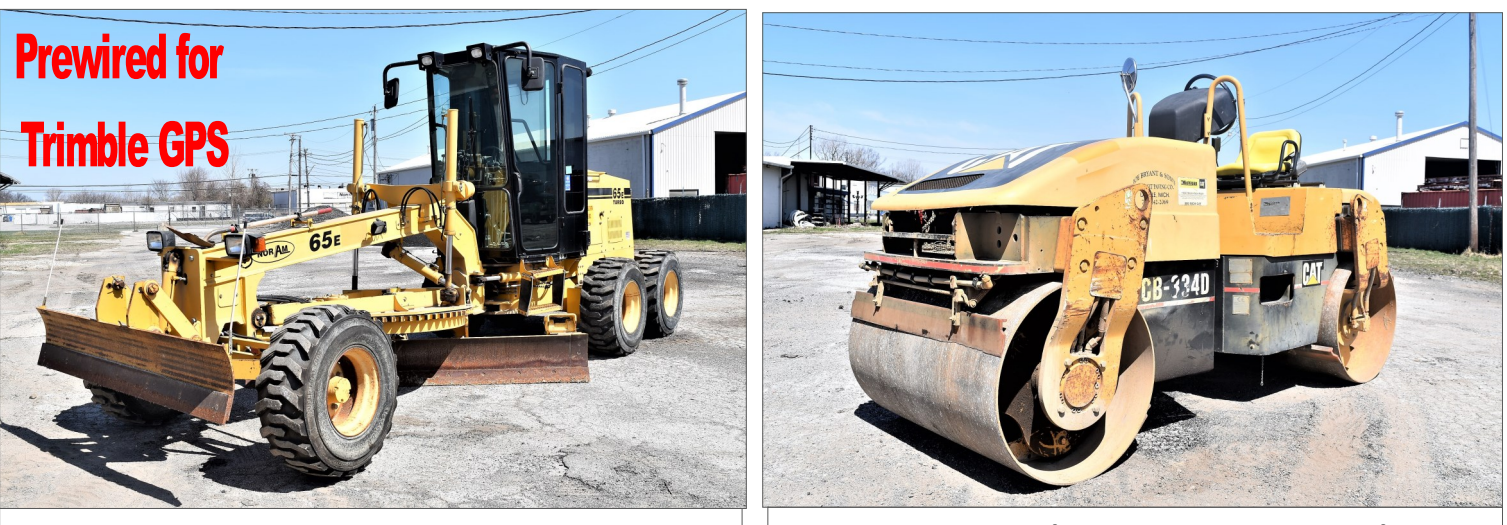
2007 NorAm 65E motor grader, 1057 hrs!!