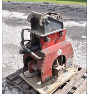
Allied 9700C plate compactor excavator mount