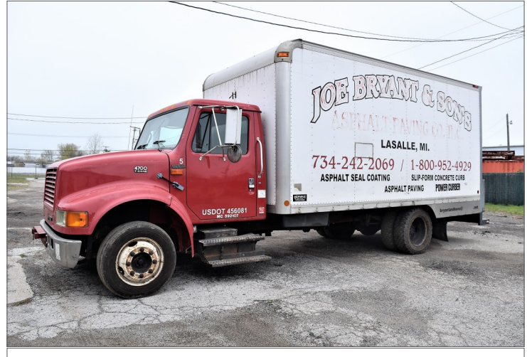
1999 International 4700 box truck