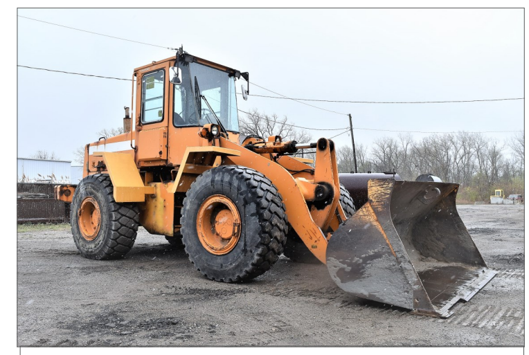
1999 Hyundai HL 740-3 wheel loader, 4318 hours,