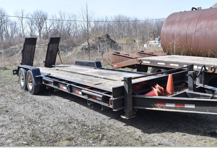
1989 AEM 22' Equipment trailer