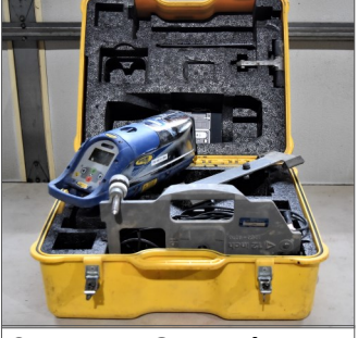
Spectra DG711 pipe laser w/case