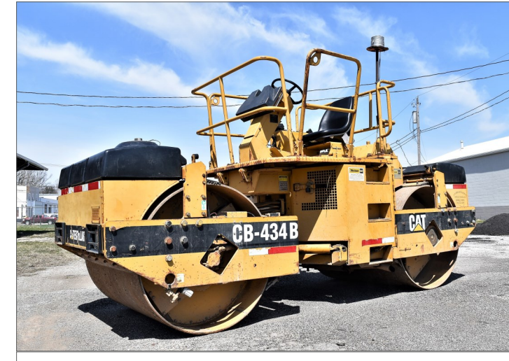
1995 CAT CB-434B vibratory compactor

Whalen Realty & Auction Itd 3 Whalen Realty & Auction Itd 4