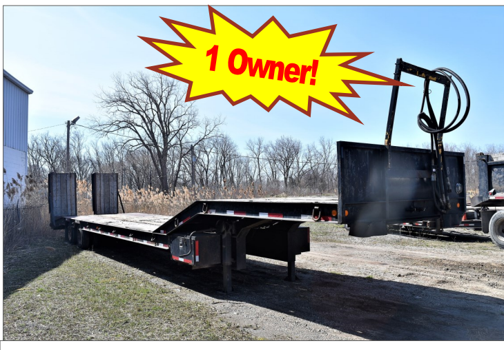
1997 Trail Boss 40' paver special trailer, 1 Owner