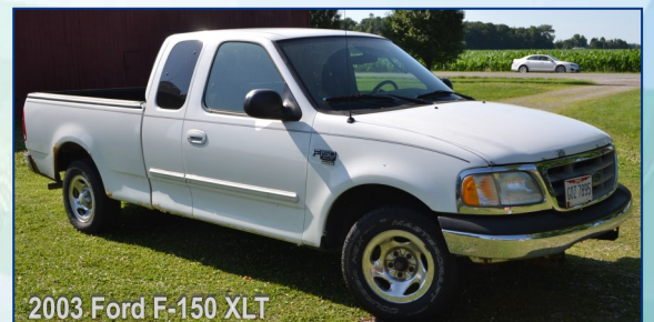
2003 Ford F-150 XLT