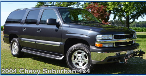
2004 Chevy Suburban 4x4