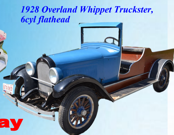
1928 Overland Whippet Truckster, 6cyl flathead