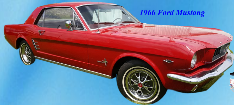
1966 Ford Mustang

LARGE 2 DAY ABSOLUTE AUCTION FRIDAY & SATURDAY AUGUST 9 & 10, 2019 Friday @ 10a.m. 100 Pocket Watches, 75+ Fruit Knives, Artwork, Furniture & Collectibles Friday @ 3p.m. Firearms, Ammo & related items Saturday @ 10a.m. Advertising, Toys, Tools, Vehicles & Equipment WHALEN AUCTION BLDG., 8020 MANORE RD., NEAPOLIS OH (gps use Grand Rapids OH 43522)