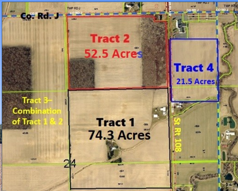
Tract 1 has 2 story farm house, barns & buildings.

WHALEN REALTY & AUCTION, LTD. P.O. Box 550 Neapolis OH 43547