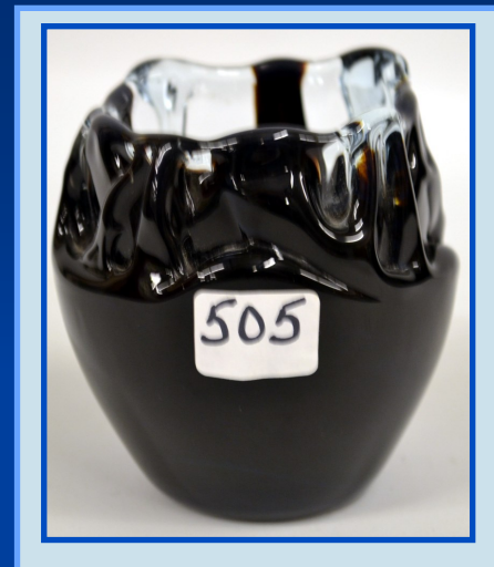
505 Dominick Labino 1967 , 4" vase, hot tooled design in silver schmelz with clear