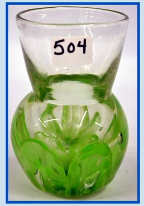
504 Kerry Zimmerman 1987 green and clear paperweight style vase 5"

506 Carl Radke attractive blue aurene feather pulled vase 13.5"