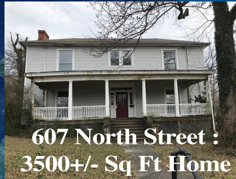
607 North Street : 3500+/- Sq Ft Home