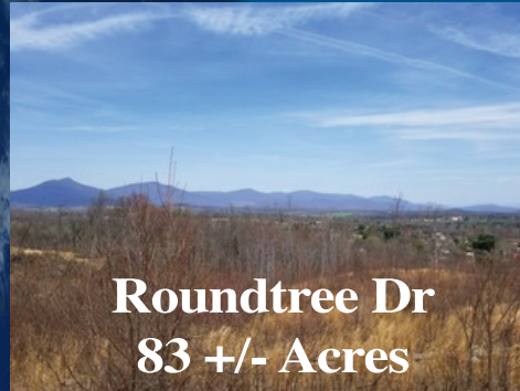
Roundtree Dr 83 +/- Acres