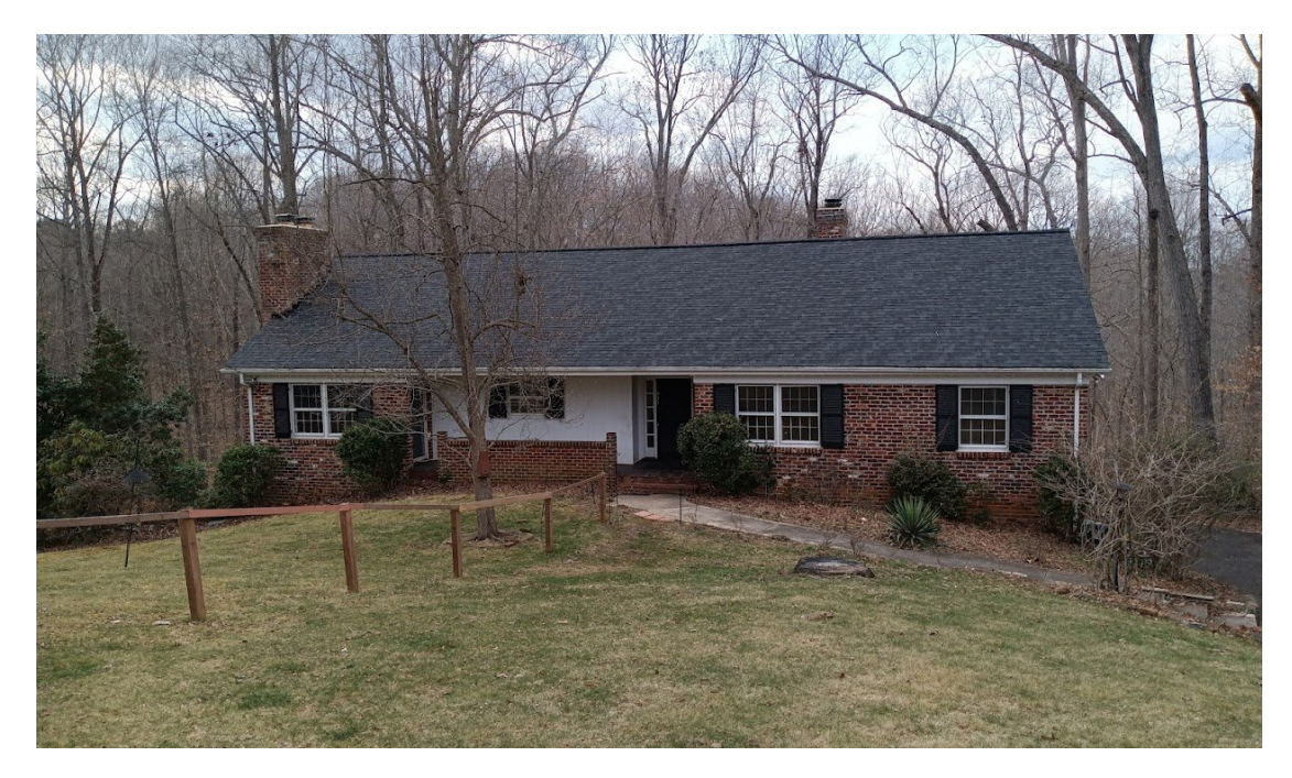
Property & Auction Location: 937 Rothowood Rd, Lynchburg VA 24503 Auction Date: Friday April 28th @ 12PM

Buyer's premium: 10% added to the high bid to determine the final sales price.