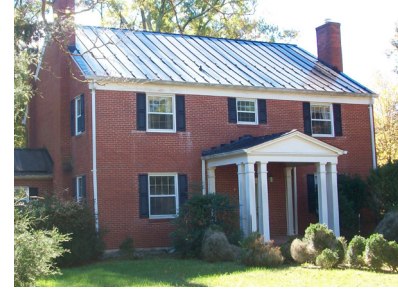
Tract 1: 8475 Cascade Rd Axton VA NOT selling at Absolute

1,360 sq ft, 3 bedrooms, 2.5 baths, attached garage, & a detached garage First floor laundry room, full finished basement 47.45 +/- Acres, mostly wooded Appliances convey