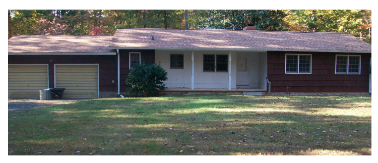
Tract 2: 7600 Morgan Ford Rd, Axton VA NOT selling at Absolute

1,360 sq ft, 3 bedrooms, 2.5 baths, attached garage, & a detached garage First floor laundry room, full finished basement 47.45 +/- Acres, mostly wooded Appliances convey