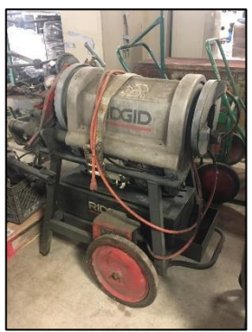
Block # 2 Used hand tools and supplies

Block # 3 (Equipment Yard) Variety small equipment and misc. items.