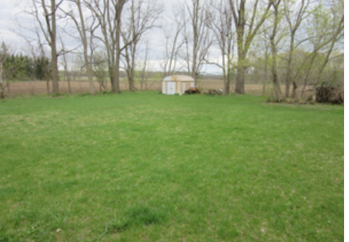
FOR INFORMATION ONLY - ACCURACY NOT GUARANTEED