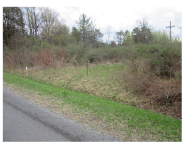
FOR INFORMATION ONLY - ACCURACY NOT GUARANTEED