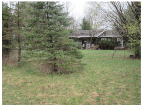
FOR INFORMATION ONLY - ACCURACY NOT GUARANTEED