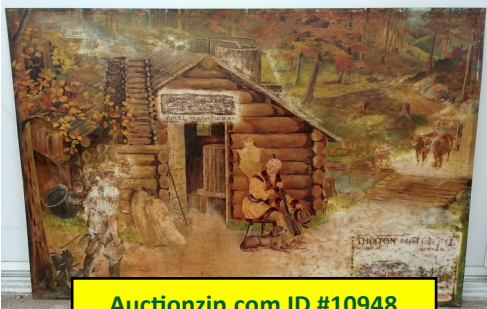
Auctionzip.com ID #10948

TERMS & CONDITIONS: All Bidders Must Register With Photo I.D. PERSONAL PROPERTY—Payment in Full With Cash Or Check Day Of Auction. NO BUYERS PREMIUM ON PERSONAL PROPERTY. 6% Sales Tax Added To All Purchases Unless Resale Number Present. All Personal Property Sold AS IS WHERE IS With No Warranty Expressed Or Implied. All Announcements Made Day Of Auction Take Precedence Over All Advertisements. Sellers Nor Agent Responsible For Accidents.