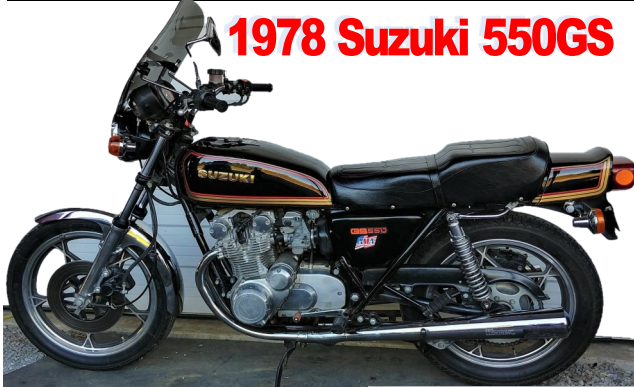
1978 Suzuki 550GS

SATURDAY—JANUARY 5th, 2019 @ 10:00 CST 410 CALVARY DR GLASGOW KY 42141— NATIONAL GUARD ARMORY