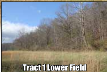
Tract 1 Lower Field