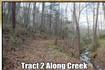
Tract 2 Along Creek