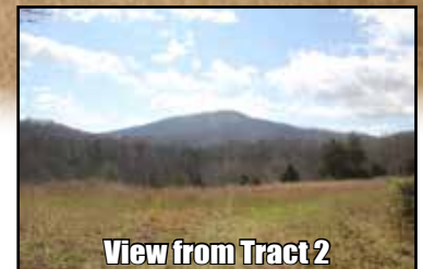
View from Tract 2