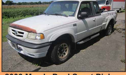
2003 Mazda Dual Sport Pickup