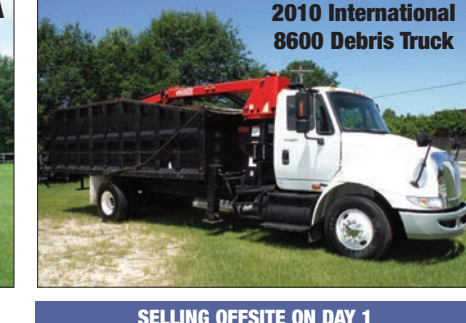
SELLING OFFSITE ON DAY 1 Both of these items are located in Tuscaloosa, AL