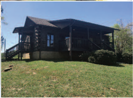
3 Bedroom, 2 Bath Cabin on Interior Lot with Common Waterfront Lot rights on Waxahatchee Creek/Lay Lake in Chilton County, Alabama