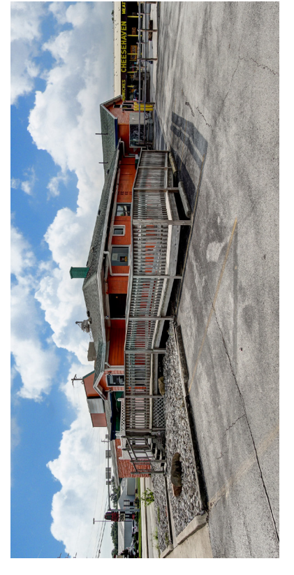
STAY CONNECTED: 🚹 💌 🛅 👂 🛗 🧿 ©2018 Pamela Rose Auction Company, LLC

BIDDING ENDS: THURSDAY, OCTOBER 18, 2018 AT 12:00 PM 2940 EAST HARBOR ROAD, PORT CLINTON, OHIO 43452 Iurn Key Restaurant Near The Lake Erie Islands