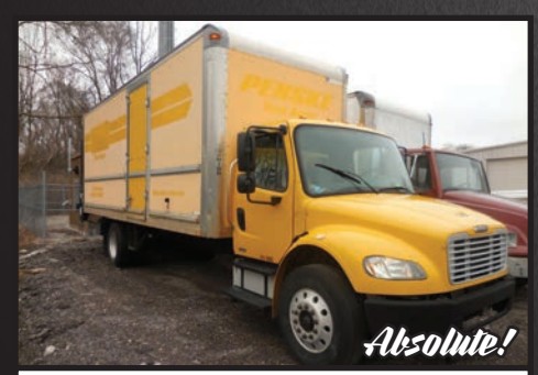
LOT# 104 | 1999 Freightliner FL70 24' Straight Truck