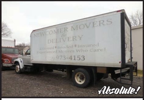
LOT# 106 | 1995 Ford F800 20' Straight Truck

Bid Online Today At PamelaRoseAuction.com