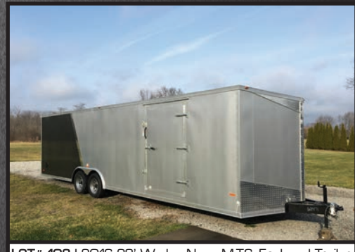
LOT# 103 | 2016 28' Wedge Nose M.T.S. Enclosed Trailer