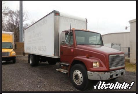
LOT# 105 | 2006 Freightliner M2106 24' Straight Truck