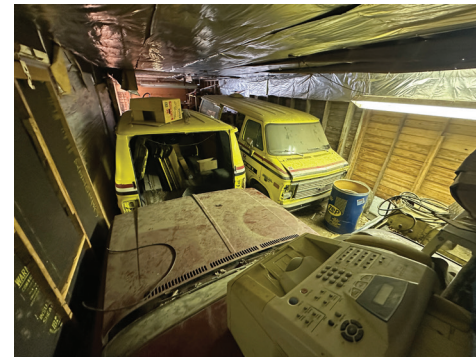
2 SIERRA LANE, Arcanum, Ohio 45304