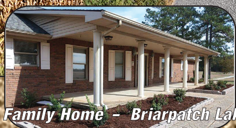
Yoder Family Home - Briarpatch Lake Road

Productive - Irrigated Henry County, TN FARMLAND