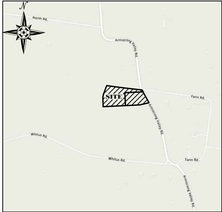
VICINITY MAP: NOT TO SCALE