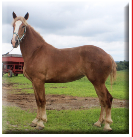
CINDERELLA'S LADY FLASH