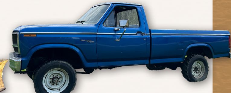
'81 Ford - '31 Model A: 1981 Ford Ranger F-250

PARCEL 1: 5 acres with a solid two-story farmhouse ready for you to call home. With 1,730 square feet of living space, the home offers 4 bedrooms on the second floor. Features of the main floor include the kitchen, dining room, family room, full bath, and laundry room. The home is solid with replacement windows, newer roof, and enjoys the benefit of free natural gas supplied from a well on the property. Bring your cosmetic ideas and add to the character this home offers. The 5 acres included with this parcel will surely add to the enjoyment of the property. Rolling terrain, a runoff creek, and room to add your outbuilding and animals.