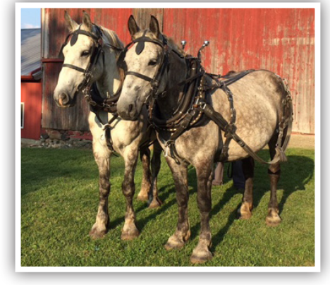
Lot #17-18 Lot #24-25