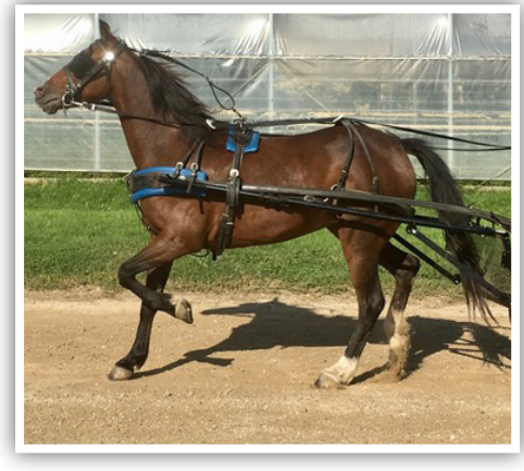
Lot #452-453 Lot #413