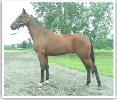
Lot #232 Lot #235