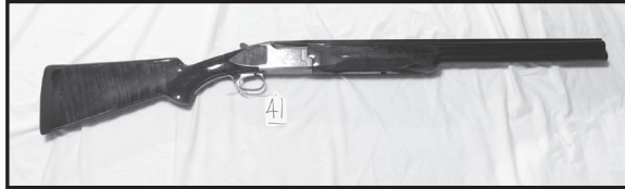
#41 BROWNING Citori 12 ga

Guns will be held offsite till Auction Day!