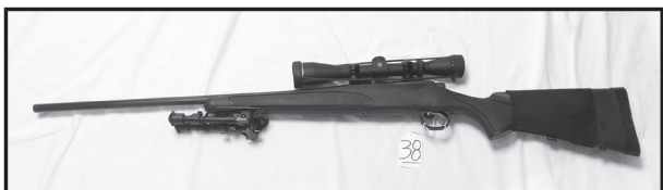
#38 REM 700 .243