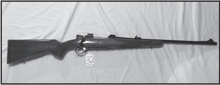
#32 MARLIN 7 .270