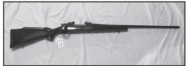
#12 REM 700 .300 Win Mag