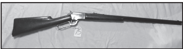
#75 MARLIN 92 .22