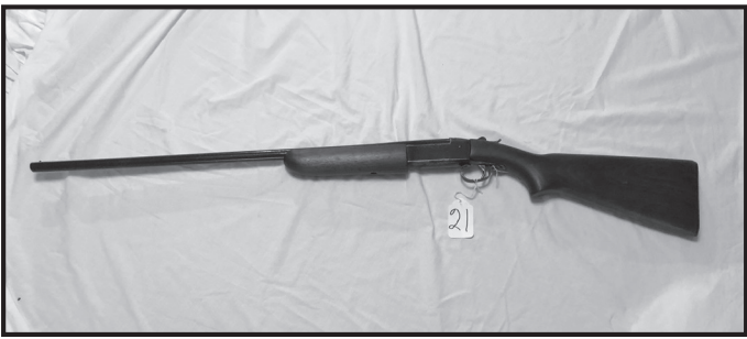
#21 WIN 37 .410

First Class Mail Presorted U.S. Postage PAID Mt. Pleasant, MI 48858 Permit No. 110