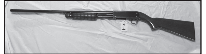
#1 ITHACA 37 20 ga