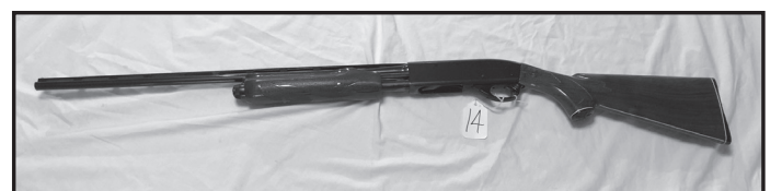
#14 REM 870 .410 Lightweight