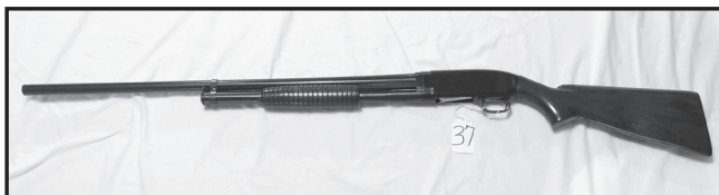
#37 WIN 12 12 ga