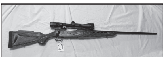
#22 MOSS .300 Mag