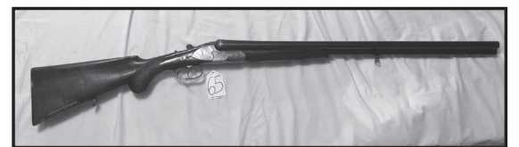
#65 EXCELSIOR Drilling Gun