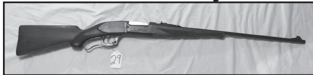
#29 SAV 99 300