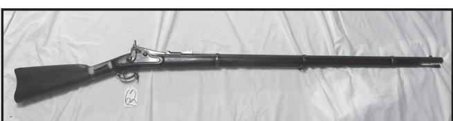
#62 US SPRINGFIELD 1866