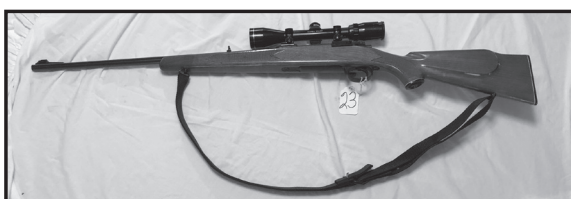
#23 MIDLAND .308