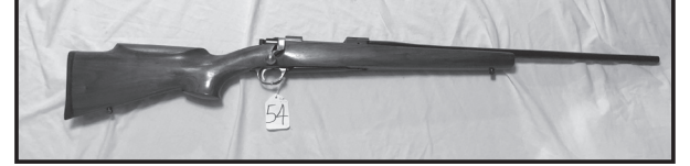
#54 RUGER M77 .280