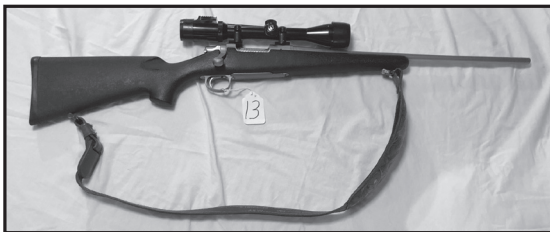
#13 REM 7.308