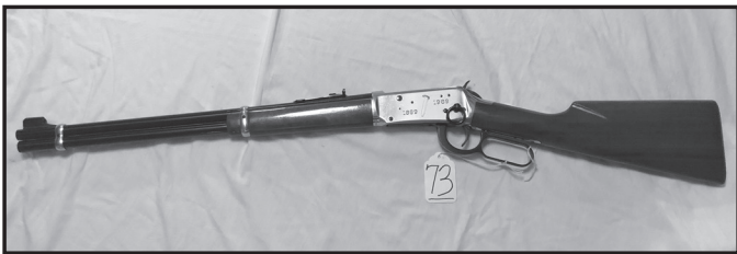
#73 WIN 94 30-30 Gold Spike Com