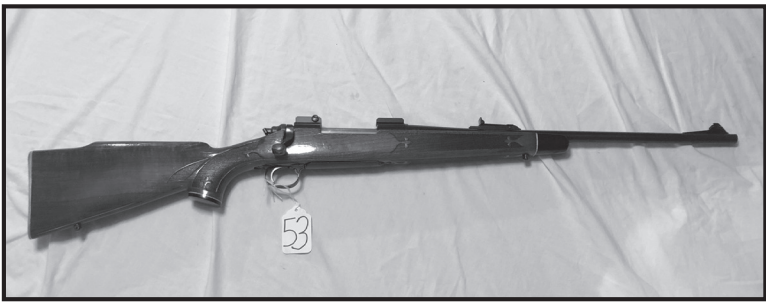
#53 REM 700 30-06