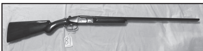
#81 ROSS .410 SxS