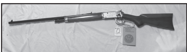
#72 WIN 94 30-30 Lone Star Com