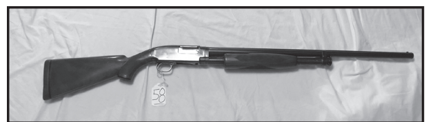
#58 WIN 12 16 ga Skeet