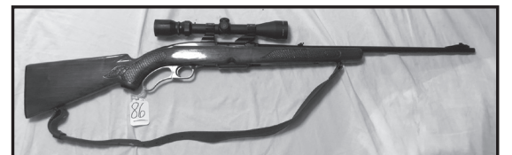
#86 WIN 88 .308