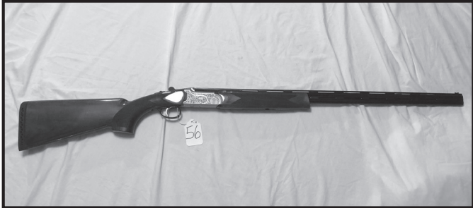
#56 TRISTAR A10 O-U