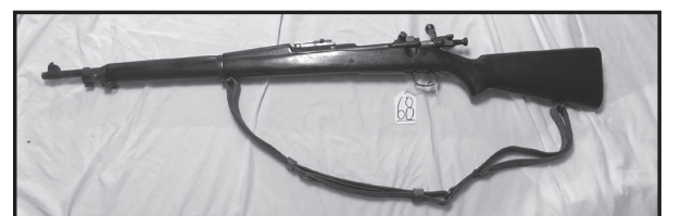
#68 US SPRINGFIELD Armory 1903 Flaming Bomb