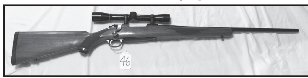
#46 RUGER M-77 .223