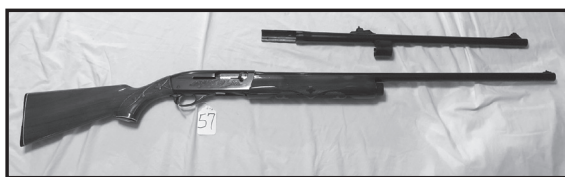
#57 REM 1100 12 ga w-extra slug barrel