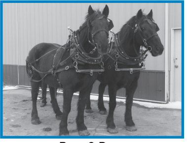
Ross & Boss