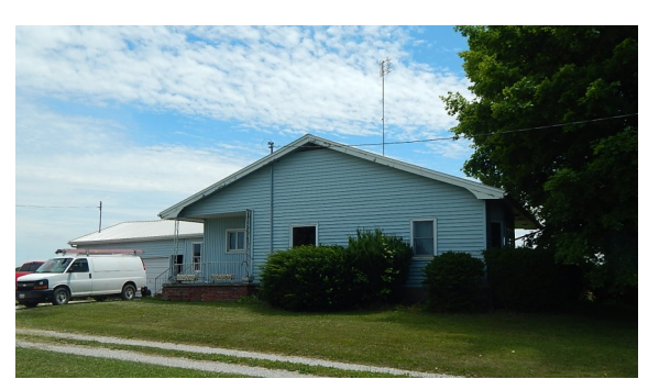
Open for Inspection: Wednesday, August 3rd from 5:00 - 6:30 pm or shown by appointment, call auctioneer.