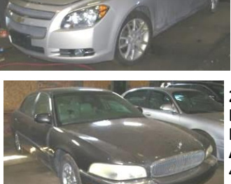
MALIBU, tan, 2012 Dodge Caravan, 1998

3) Rackmount Pc's 1.86 Ghz, 2 Gb Ram, 23 Gb Hd, Tandberg "Video Phone", Radio Shack CB Radio, Lexmark X544 Printer, 6) I-pad (2nd Gen.), 2) Samsung Tablets (32 Gb), 2009 Hsgp Grant, 5) Older Desktop Monitors (nonhdmi), Dell Laptop Latitude D610, Fuji F470 6 Mega Pixel Camera, (NIB) Logitech Webcam C270 Complete, 4) Panasonic Lumix TZ4 Digital Cameras-8 Megapixel, Hp Deskjet 460 Printer,