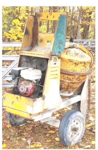
Gilson cement mixer w/ Honda 8 hp gas motor,