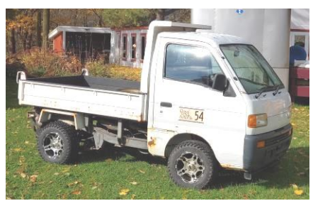
Suzuki mini truck ORV only, gas eng, 5 spd 4 wd,