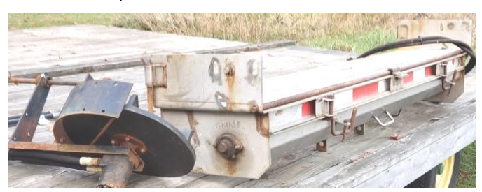
8 ft across the box Stainless Steel salt spreader,

2008 Ford F150 Crew Cab 4 Wd 5.4 Eng. Auto Trans, Hit On Drivers Side Needs All Body Panels,