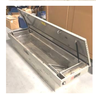
Tractor Supply Crossbody Toolbox For Full Size P/U,