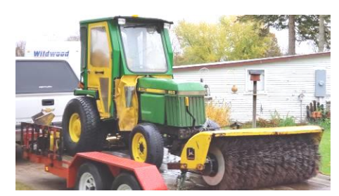
John Deere 955 dsl, hydro stat. 4 wd tractor, canvas cab has front mt 246 sweeper and 72" belly mower deck,