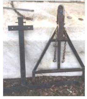
Reese Hitch Receiver Tow Bar