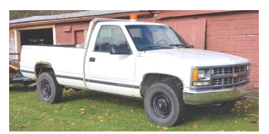
2000 Chevy 3/4 ton 2 wd pick up, 5.7 V8, A-T shows 84,365 mi,