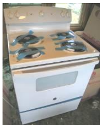
GE Electric Stove, Lightly Used,