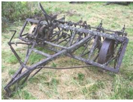
8' Trip Field Cultivator On Steel,