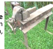
Lg. Vise Mtd On I-Beam,