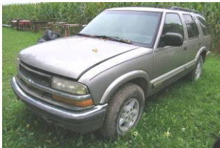
2000 Chevy Blazer, 4 Wd, 4.3 Ltr,

AC Transport Disc Frame-Pull Type & Cultivator, New Lion 2500 Hydraulic Cylinder, 3 Pt. IH 6' Back Blade, 6' X 10' Trailer Frame, Ajax 6'x 10' Single Axle Trailer, 66" X 8' Single Axle Trailer, NIB Meyers Blade Markers, Western 8' Snow Plow, Western 7-1/2' Front Snow Blade- Off Ford Full Size Bronco, 2) Meyers 7-1/2' poly snow blades, 17' Tandem Axle Car Hauler Trailer-Needs Tires,