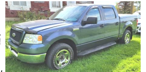
2005 Ford F150 Crew Cab, 2 Wd, Pick Up, 5.4 V-8 Has ARE Fiberglass Cap, 133,162 MI,