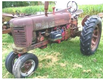
IH Farmall 300 Gas Narrow Frt. Tractors Torque Amp PTO,