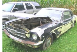
1965 Mustang Pony 289, 3 Spd. Trans, V-8,