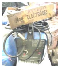
90-amp Lux Wire Welder,