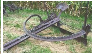
John Deere 7' Pull Type Disc, 8' Tow Ditching Blade,