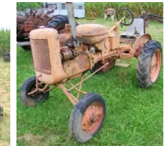
Allis Chalmers CA Tractor (No PTO)