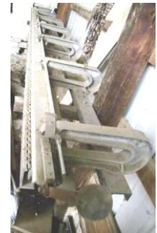
12 Ft. Aluminum Brake Unit,