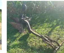
John Deere 2 Bottom Mounted Plow,