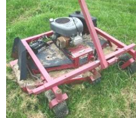
Swisher 55" Cut, Tow Mower, Has 14.5 Hp Gas Eng. W/Ele. Start,

Lincoln 225 Arc Welder, Qty. Of Weld Rod, 2) F3 36 Stihl Trimmer, Extra New Blades, Bolt Bin-Full, Tire Chains, 2 Hay Forks And Trolley, Stihl Ts 350 Super Cut Off Saw, Rigid Triston Pipe Vise & Bender, 2) 12 Volt Sprayer Tanks, Air Chisels & Impacts, Wheel Barrels, 18 Ft. Reverber Ray Tube Heater, 2) Engine Stands, 3000 Lbs. Winch W/Remote, Power Winch, 2 Gal. Container Marathon Oil, 2 Cycle Oil, 15 Bottles Dexron Oil, Craftsman Miter Saw, McCulloch 18" Chainsaw, 3/4 X 10 Cutter, 72" X 30 Wood Top Bench, B 7D Battery Power Drill, Pr. Jack Stands, Cable Come-A-Long, MIT 3/4" Drive Socket Set, Clark Auto Parts Washer, Stanley Hand Saw, Set Of Torches, 2) Chain Falls, Hi Lift Jack, Michelin Floor Jack, 26" X 26" Welders Table, Alum. Extension Ladders, Pec Electric Chain falls, 2 Roll Tool Box, Engine Stand, Flat Belt Buzzsaw & Extra Blades,