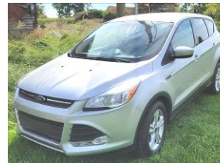
2016 Ford Escape SE, Silver, 2.5 Ltr. Eng, 48,765 Mi, Nice Clean Car!