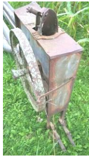
New Idea No.95 Corn Sheller,

Dishes, Glassware, Pots, Cast Iron Pans, Floor & Table Lamps, Recliners, Brinkman Smoker, Expert Gas Grill, Canning Jars -Kerr & Others, Blue Ball Jars, Microwaves, Flat Screen TV's : 32" & 42" Sanyo, Presto Pressure Canner, Kirby Vac, Antique Square Table, Bucksaw, Toy Tonka Truck, Pine Table & Chairs, Painted Dresser W/Oval Mirror, Two Man Crosscut Saw, Republic Barrel Stove, Lg. Qty Chiltons & Other Repair Manuals, Qty. Of Cassettes, Dvd's, VCR Tapes,