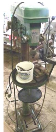
Central Machine 16 spd. Drill press,