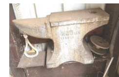
Rare Find! 220 Lbs. Anvil.