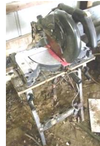
Power Miter Saw W/Table,