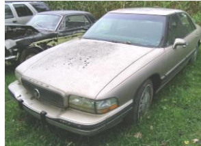
1995 Buick LA Sabre, 4 Dr,