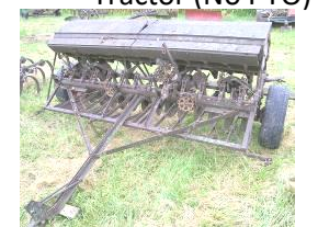
IH 13 Hole Grain Drill,