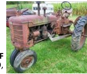
IH Farmall C NF Tractor W/ Hyd PTO,