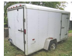
Haulin 12' Enclosed Trailer, Drop Rear Door, Ramp,