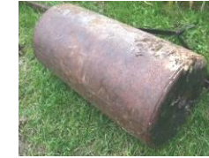
48" Metal Lawn Roller,