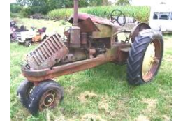
Massey Harris (101 Senior 44?) Rear End Parts,