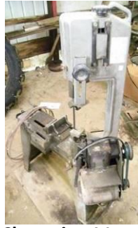
Champion Metal Bandsaw,