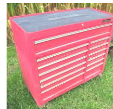
6) Roll Tool Chests,