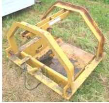
3pt King Cutter Dirt Scoop, Oliver 10' Transport Disc, 8' Set Of Drags,