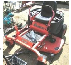
Bad Boy 54" 0-turn mower, Kohler 7000 series 725 cc engine,