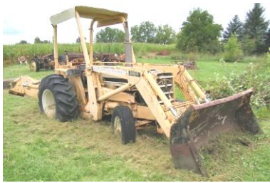
International 250 Series A Dsl. Loader Backhoe, Industrial 77" Frt. Bucket, 16" X 27" Backhoe Bucket,