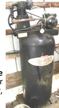
Pro Force 60-Gal Air Compressor,