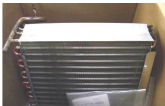
NIB Miller Lp Gas Furnace, Mdl. C3QA, Air Conditioner, Condenser, 2-1/2 Ton Outside Condenser,