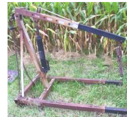
2 Ton Hyd. Cherry Picker,