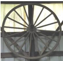
Narrow Wood Buggy Wheel