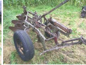
IH 3-14S Trailer Plow Cyl. Lift,