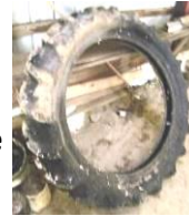
New Tractor Tire, Firestone Field & Road,