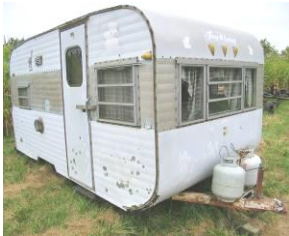
Tag-A-Long 13' Camper Trailer, Single Axle, 4'x6' Single Axle Trailer,