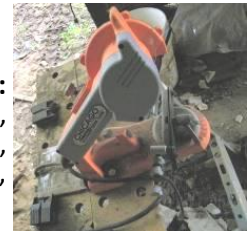
Chicago: Chainsaw, Chain Sharpener, 2 Hp Generator,