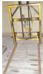
3 pt Agi-Tek forks 30" lift,