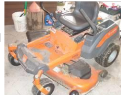
Husqvarna 24 hp/54" "0" turn mower, shows 44 hrs,