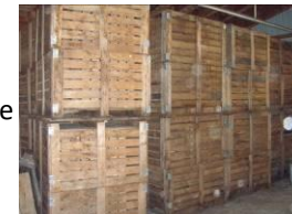
Approx. 120 44" w. x 47" l. x 24" deep, Wood Crate Boxes ( 7 contain cut fire wood , 8'x18' Crate hauling tandem axle trailer,

See Website - jrthumbauctioneers.com for full listing