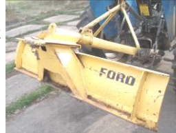
3pt Ford 6' back blade,