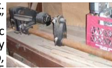
Craftsman 12" x 40" bench wood lathe on wood bench,