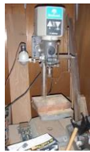
Rockwell 11" bench drill press,

2 Man Crosscut Saw, Slide Rule, 2) Wood Block Planes, Meat Saw, Kennedy 25" 2 Drawer Machinist Box, Pencraft Tall Metal Machinist Box, Brace-N-Bits, Old Wooden Tool Chest, Sears Craftsman: Nib Utility Sharpener, Belt & Disc Sander On Stand, 6" Jointer On Stand, Roll Around Base Tool Chest, Cast Top Shaper Unit, 1.8 Gas Chainsaw, 4 & 8 Ton Hydraulic Bottle Jacks, Router W/ Bench Table, 8" Depth Dovetail Fixture, 10" Saw Blade & Dado Set, 10" Table Saw W/Table Add Ons, Ele. Reciprocating Saw W/Case, Lg. Open & Box End Wrenches, Socket Sets, Vise Grips, 1/2 Hp 6" Double Bench Grinder, BLACK & DECKER: Power Miter Saw, Workmate Bench, Starrett Wood Drill Set, Sm. Floor Jack, 2 Hp Circular Saw, 115 Pc. Industrial Drill Bit Set, Qty. Of Pipe & Bar Clamps, Wood Clamps, 2) Roll Material Handlers, Box Folding Saws, Set Of Gear Wrenches, Nut & Bolt Caddy's, Measure Wheel, 55 Gal. Barrel W/Hand Pump, Sm. Arbor Press, Portable Air Tank, Several Prs. Of Hand Pruners, Long Hand Brush Axe, Cable Come-A-Long, Qty. Of Sand Paper & Blocks, Special Axe,