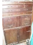
Wies tiger oak tall machinist tool box,

2) Corona 32" Bypass Loppers, Tape Measures, Approx. 100 Plastic Milk Crates, 14"X17"X12" Wood Apple Crates, Small Folding Scaffolding Unit, Campbell Hausfield 3.5 Hp Ele. Air Compressor, Werner 28' Alum. Extension Ladder, 8' Wood Step Ladder, 8' Alum. Tri Ladder, Centech Battery Charger & 3 In 1 Port Power Pack, MIT: 1/2 Drive Air Impact, 15 Pc. Impact Socket Set, 9 Pc. Deep well 3/8 Drive Socket Set, PITTSBURGH: Metric Offset Ratchet Wrenches, 3 Pt. Flex Head Ratchets, 2) 11 Pc. Long Handle Wrenches & Std. Metric, 2pc. 16" Screw Drivers, 2) 15 Pc. Metric & SAE Stub Svc Wrench Sets, Schumacher 6-12 Volt Battery Tester, 3 Pc. Locking C- Clamp Set, Shark Clamp, King Craft 2000 Portable Generator, Offset SAE Wrenches, Central Pneumatic 3 Gal. 100 Psi Oil less Air Compressor, ATV 1500 Lbs. Lift, CHICAGO: Multi Use Sander, Cutoff Saw & Scraper, Elect. Long Shaft Die Grinder, Industrial 1/2" Ele. Impact Tool, Ele. 4" Angle Grinder, 1/2" Ele. Hammer Drill, FLAT BED CARTS ON CASTORS: 1) 2'x3', 2) 4'x32", 2) 53"x27", 2) Face Cord Firewood, 2) Old Chest Freezers, 2) Folding Alum. Cots, Umbrella, Lg. Roll Field Tile, Old Pallet Jack, Qty Of New And Used Pallets,