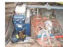
5 Hp Honda on amp air compressor, mtd on skid w/3 air pwr. pruning shears,

2) Corona 32" Bypass Loppers, Tape Measures, Approx. 100 Plastic Milk Crates, 14"X17"X12" Wood Apple Crates, Small Folding Scaffolding Unit, Campbell Hausfield 3.5 Hp Ele. Air Compressor, Werner 28' Alum. Extension Ladder, 8' Wood Step Ladder, 8' Alum. Tri Ladder, Centech Battery Charger & 3 In 1 Port Power Pack, MIT: 1/2 Drive Air Impact, 15 Pc. Impact Socket Set, 9 Pc. Deep well 3/8 Drive Socket Set, PITTSBURGH: Metric Offset Ratchet Wrenches, 3 Pt. Flex Head Ratchets, 2) 11 Pc. Long Handle Wrenches & Std. Metric, 2pc. 16" Screw Drivers, 2) 15 Pc. Metric & SAE Stub Svc Wrench Sets, Schumacher 6-12 Volt Battery Tester, 3 Pc. Locking C- Clamp Set, Shark Clamp, King Craft 2000 Portable Generator, Offset SAE Wrenches, Central Pneumatic 3 Gal. 100 Psi Oil less Air Compressor, ATV 1500 Lbs. Lift, CHICAGO: Multi Use Sander, Cutoff Saw & Scraper, Elect. Long Shaft Die Grinder, Industrial 1/2" Ele. Impact Tool, Ele. 4" Angle Grinder, 1/2" Ele. Hammer Drill, FLAT BED CARTS ON CASTORS: 1) 2'x3', 2) 4'x32", 2) 53"x27", 2) Face Cord Firewood, 2) Old Chest Freezers, 2) Folding Alum. Cots, Umbrella, Lg. Roll Field Tile, Old Pallet Jack, Qty Of New And Used Pallets,