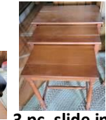
3 pc. slide in table set,