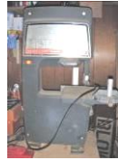
Craftsman 12" bandsaw sander,