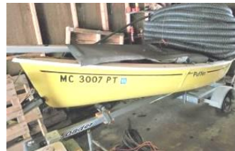
AMF Puffer 11 1/2' fiberglass sailboat has 18' alum. mast, EZ loader galvanized single axle trailer,

Otter Old Town 9' Kayak W/Paddle, Bear Bow & Arrow Set, G-Max Can Red XI Helmet, Freespirit Mens 10 Speed Bike, 10) Rod & Reels, Poles, Tackle Box, Nets, Ice Fishing Sled Tent, Runner Sled, 4) Folding Camouflage Stools, Ameristep 2-Person Ground Blind, Golf Clubs & Hand Cart, Duck Hunting Tote Filled With Supplies, Marbles Gun Cleaning Kit, Samsonite Card Table & Chairs,