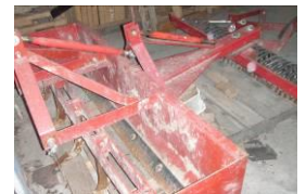
3pt TSC 6' York rake, 3pt TSC 6' box blade, 3pt Westender hydr. 40" fork lift unit,