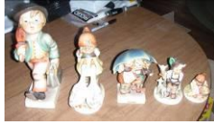
10) Goebel Hummels,