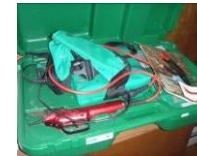
Felco swiss made battery ele. tree pruners,

MIT & True Craft 3/4" Dr. Socket Sets, Crescent Wrenches, Two & Four Wheel Hand Carts, TSC 1160psi Electric Pressure Washer, Pr. Antique Wide Wood Wagon Wheels, Grease Guns, Wire Snake, Hand Scrapers, Small Push Mower, 2-2 1/2 Gal Seven XLR Plus Insecticide, Potato Fork, Shovels, Rakes, Forks, Plastic & Metal Pails, 20) New 6' T-Posts, 18 Volt Battery Drill, Tow Rope, Ratchet Straps, MAC & Old Sears Chainsaw, Kwik Lok Hand Type 1003A Mdl A Bagger, 3) New & Some Used "Handy" Picking Buckets, Apple Bags & Boxes, Bag Closer Stand, 3) Floor Stand Apple Bag Clamp Units, Homelite XL Chainsaw & HT 19 Hedge Trimmer, Agri-Fab 5.5 Cu. Ft. Yard Cart, 3) Green Hand Yard Carts, FIMCO 12-Volt 25 Gal. Poly Tank, 2) Havah Live Traps, Box Of New Plastic Castor Wheels, RUBBERMAID: Outside 44" Chest Storage Box, Tall Storage Cabinet, 2 Wheel Yard Cart, Step Up Unit, Adj. Height Shop Stool, 3) 6' Treated Wood Benches, Trimming & Tools Belts, Shop Vac, Hand Garden Seeder, Pr. Kerosene Heaters, Wheel Barrel, Sledge Hammers, Hand Post Hole Diggers, Splitting Malls, Handy Mattock Tiller, 4) Drawer Units- Plastic,