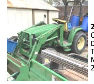
2004 John Deere Compact 4wd, Dsl, 420 Loader Tractor Mdl.# 4410, 2252 hrs,