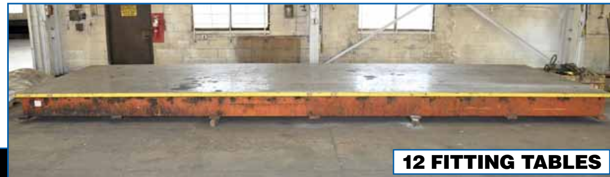
12 FITTING TABLES

GO TO WILLIAMSANDLIPTON.COM FOR MORE INFO