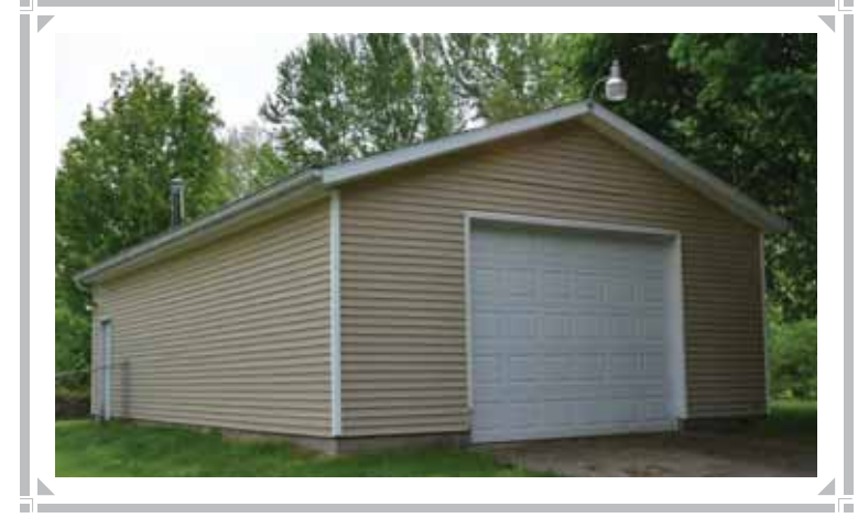
24 x 40 Extra Garage

Lot size: 330'x285'<u>+</u> Taxes: $2,017.65 (2016) SEV: $74,102 (2017) Closing: in 45 days