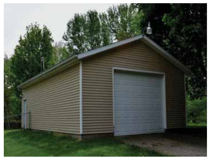
24 x 40 Extra Garage