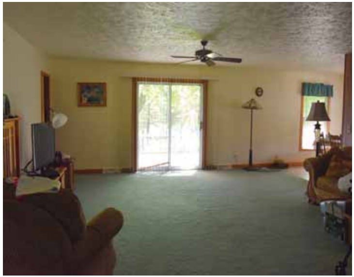
Living Room view 1