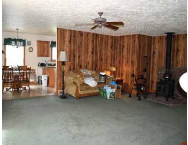
Living Room view 2