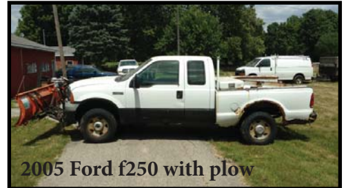
2005 Ford f250 with plow