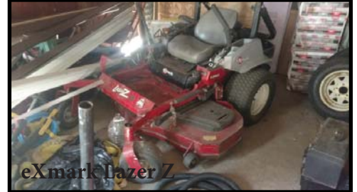
eXmark Lazer Z