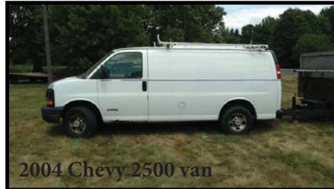
2004 Chevy 2500 van