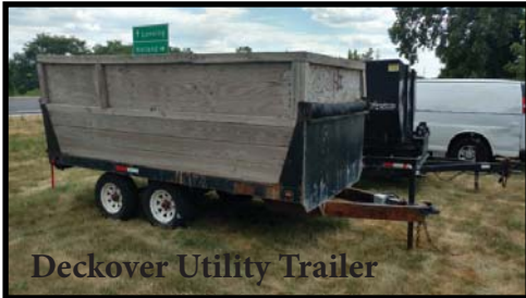
Deckover Utility Trailer

Directions: M6 to 8th ave. exit, north 100 yards to auction.