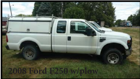
2008 Ford F250 w/plow