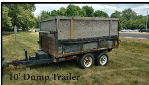
10' Dump Trailer

Champion Property is discontinuing business operations and will sell equipment at public auction: