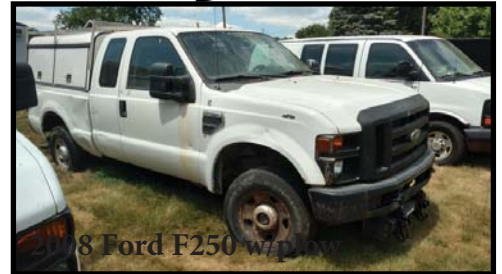
2008 Ford F250 w/plow