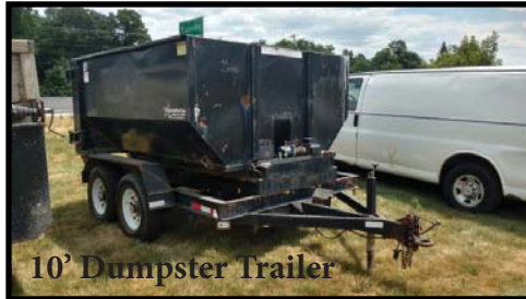
10' Dumpster Trailer