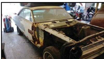
1966 Ford Fairlane