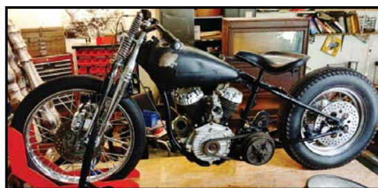
1942 Harley Davidson