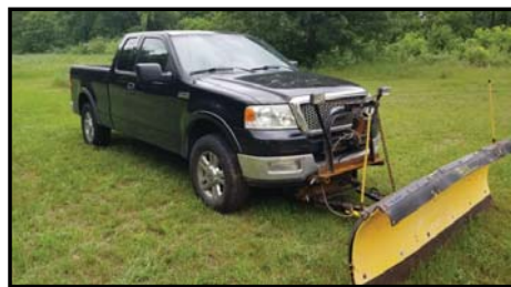
2004 Ford F-150 4x4 w/plow