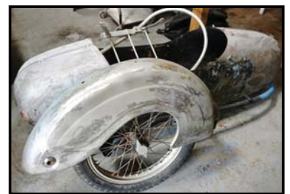
Steib Side Car