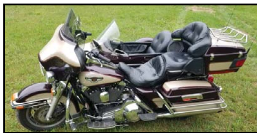
1998 Harley Davidson Ultra Classic