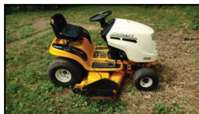
Cub Cadet LT1024