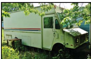
1993 Delivery Truck