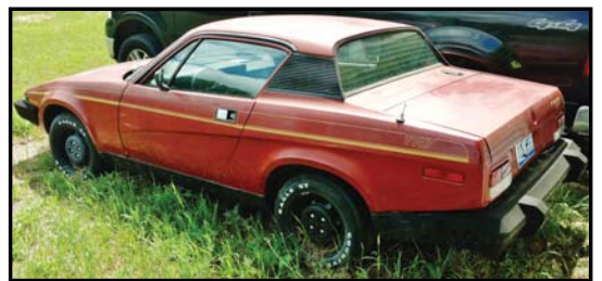
1977 Triump TR7