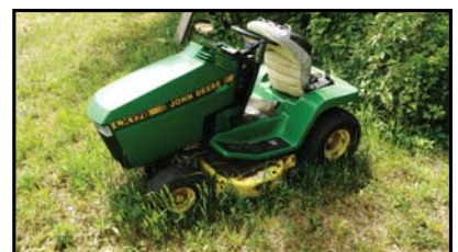
John Deere LX176