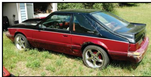
1989 Ford 5.0 Mustang