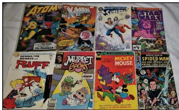
Comic Book Collection

P17 Custom rifle - Caliber unknown (30-06?) CZ Mauser 7x57 Winchester 69A - .22LR, Weaver K4 scope Savage 1914 .22LR pump action JC Higgin 12 ga. - Bolt action H&R 20 ga. single shot Iver Johnson Bulldog .38 (broken) Thompson Center New Englander Careamo Military 6.5