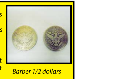
Barber 1/2 dollars

Coins 1899, 1908 Barber 1/2 dollar (2) 1937, (1) 1923 S, Buffalo nickels (3) Walking Lib. 1/2 dollars (2) Standing Liberty quarters 1908 Liberty V nickel (10) 1964-68 Ken. 1/2 dollars (6) 1940-1953 nickels (14) 1946-1964 dimes (14) 1926-1945 Merc. dimes (9) Franklin 1/2 dollars (66) 1934-64 Wash. quarters 1934 $10 bill (7) 1957 $1 bills (3) 1991 uncirc. bank sets 1961 uncirculated proof set 1957 uncirculated proof set Roman Provincial coin