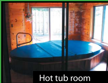
Hot tub room