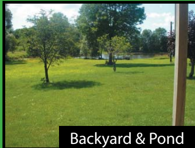
Backyard & Pond