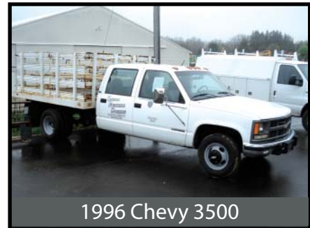
1996 Chevy 3500