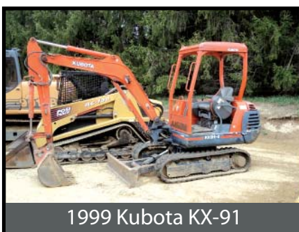
1999 Kubota KX-91