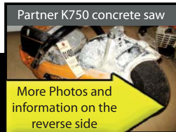
Partner K750 concrete saw