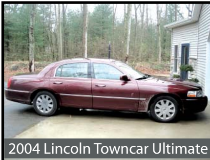
2004 Lincoln Towncar Ultimate