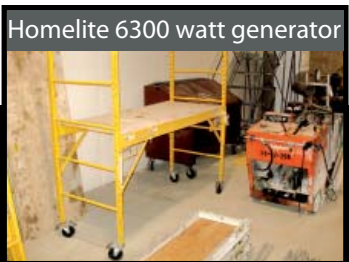
Homelite 6300 watt generator

More Photos and information on the reverse side