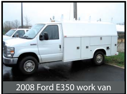
2008 Ford E350 work van