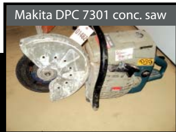
Makita DPC 7301 conc. saw