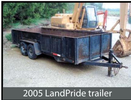
2005 LandPride trailer