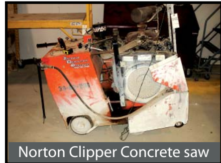
Norton Clipper Concrete saw