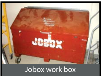
Jobox work box