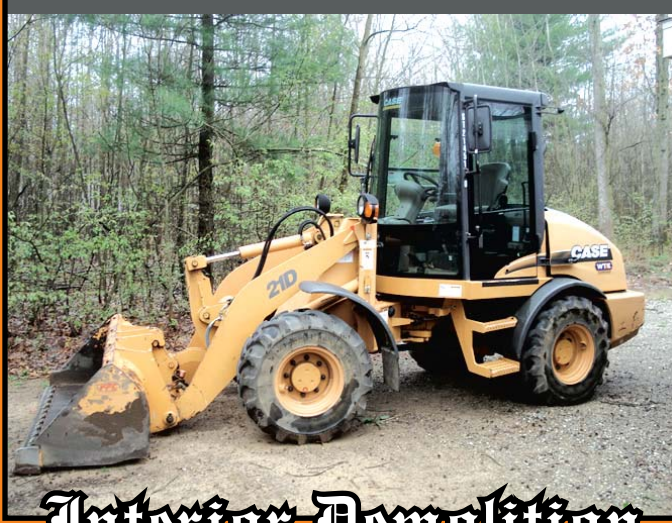
2004 Case 21D Package Loader