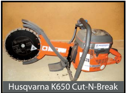
Husqvarna K650 Cut-N-Break