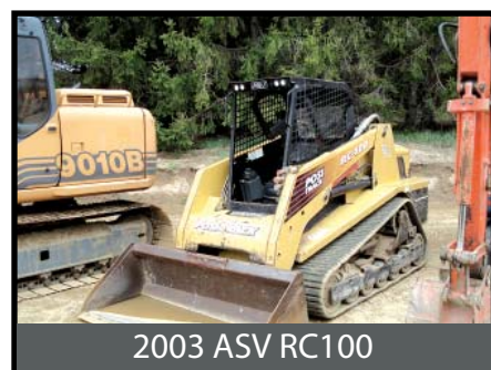
2003 ASV RC100