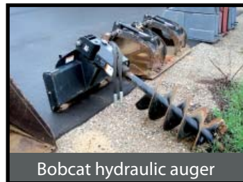
Bobcat hydraulic auger