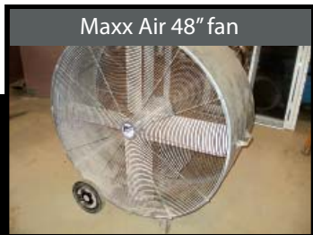
Maxx Air 48" fan