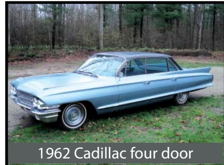
1962 Cadillac four door