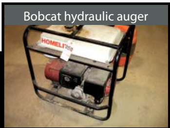
Bobcat hydraulic auger