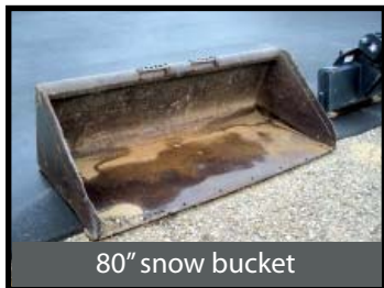
80" snow bucket