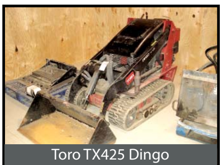
Toro TX425 Dingo