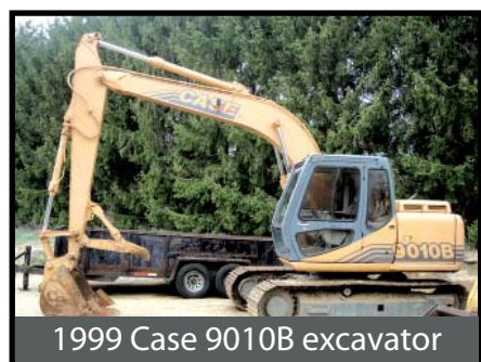
1999 Case 9010B excavator