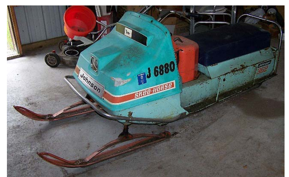
View More Details & Pictures Online.