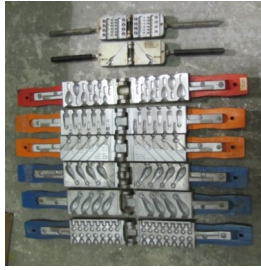
Fish Sinker Molds