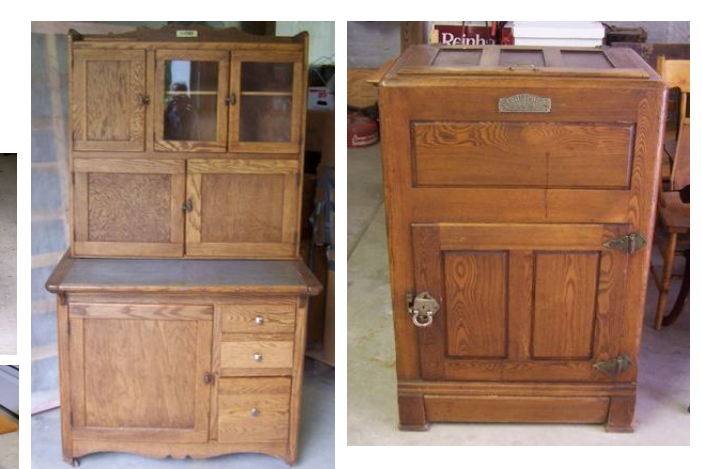
1997 Ski-Doo Rotax 500 2-up 2766 Miles, Helmets, Jackets, etc. 1995 Honda Dirt Bike XR200R, Helmet, Boots.