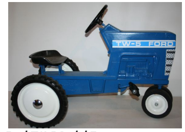
Ford TW 5 Pedal Tractor