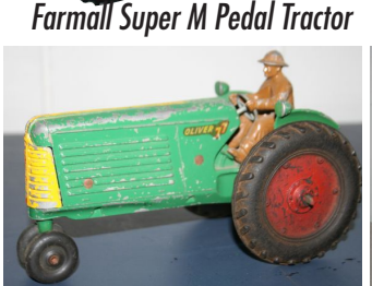
Oliver Super 77 tractor