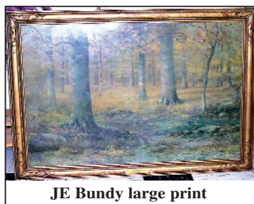
JE Bundy large print