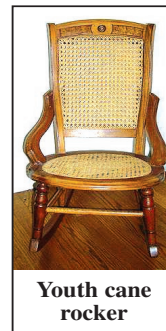
Youth cane rocker