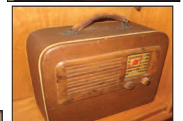
This is on back of picture at left.