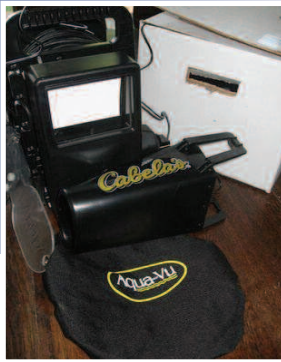
Cabella's Aqua View Fishfinder