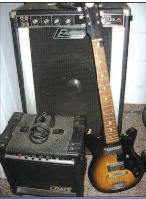
Kingston Electric Guitar #J4B & Amps