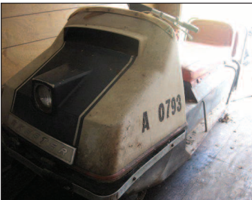
1967 Skeeter Snowmobile