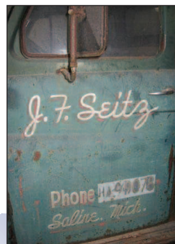
1951 Dodge Stake Truck