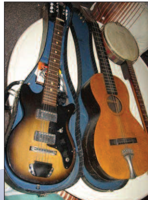
Kingston, Acoustic, Banjo