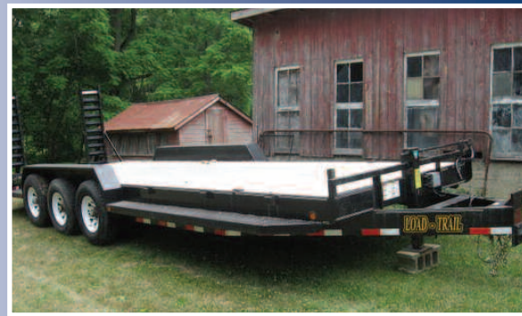
2004 Load Trail 24-Ft. Tri-Axle Trailer