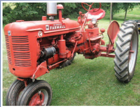
Super C Front View