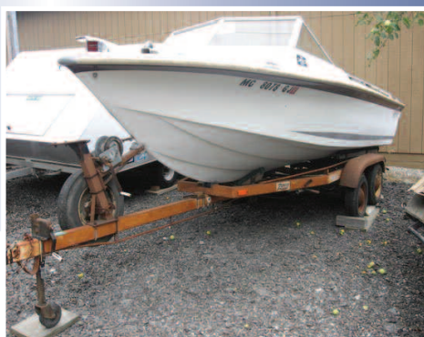
1967 Larson Boat & Trailer