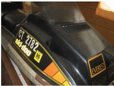
1979 Ski-Doo Everest Snowmobile E2085