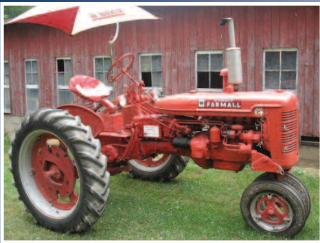
1951 Farmall Super C Tractor