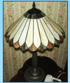
Stained Glass Lamp