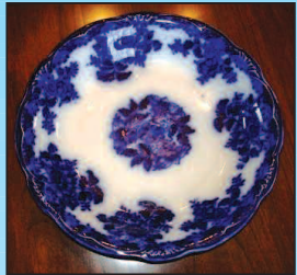
Flo Blue Bowl